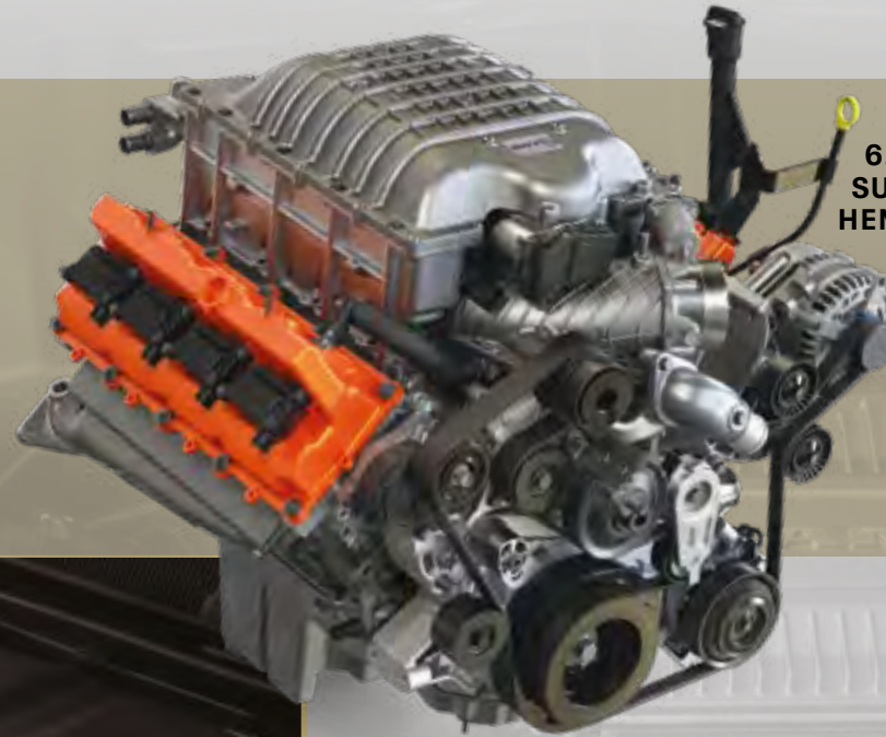
6.2L SUPERCHARGED HEMI® V8

Few engines are as legendary as the HEMI® V8. This iconic powerplant incorporates Variable Valve Timing (VVT) and a Multi- Displacement System (MDS) for max efficiencies.